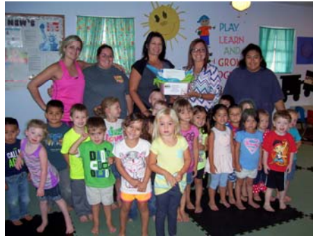
Building Blocks Daycare