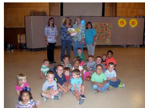
Open Doors Daycare