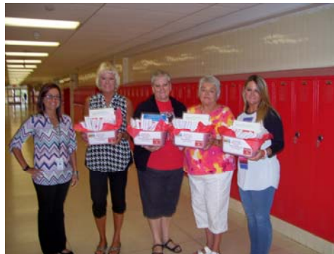
Sweetwater High School