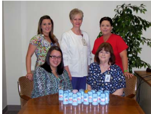
HOME HEALTH DEPT.