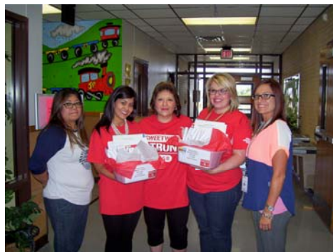
JP Cowen Early Childhood Center