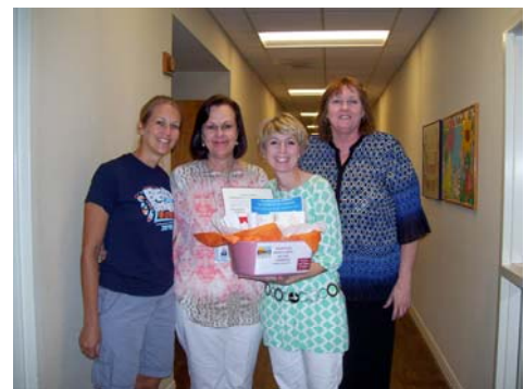
Cornerstone Christian School