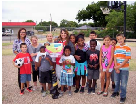
Kids' Campus Daycare