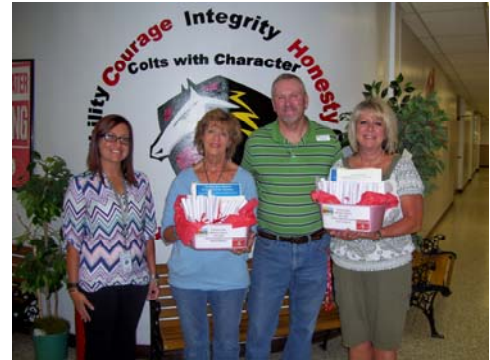
Sweetwater Middle School