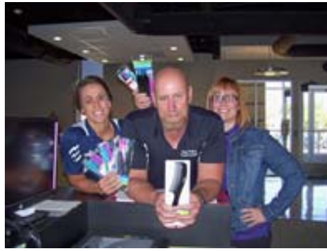
CARDIAC REHAB/WELLNESS CTR.